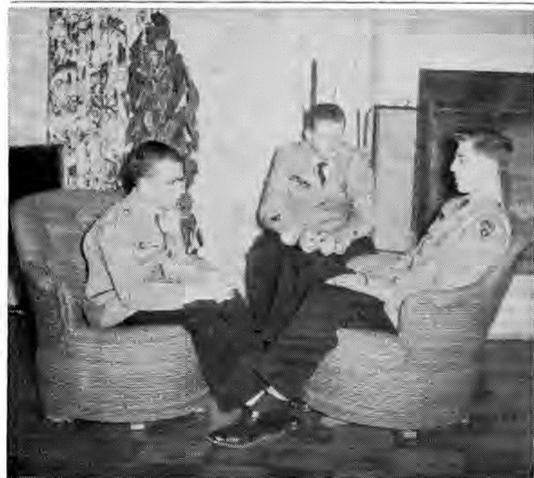
One of the newest additions to the school staff is this B-47 crew. They were assigned to this C.A.P. unit as a part of the Air Force's new disbursement of forces.