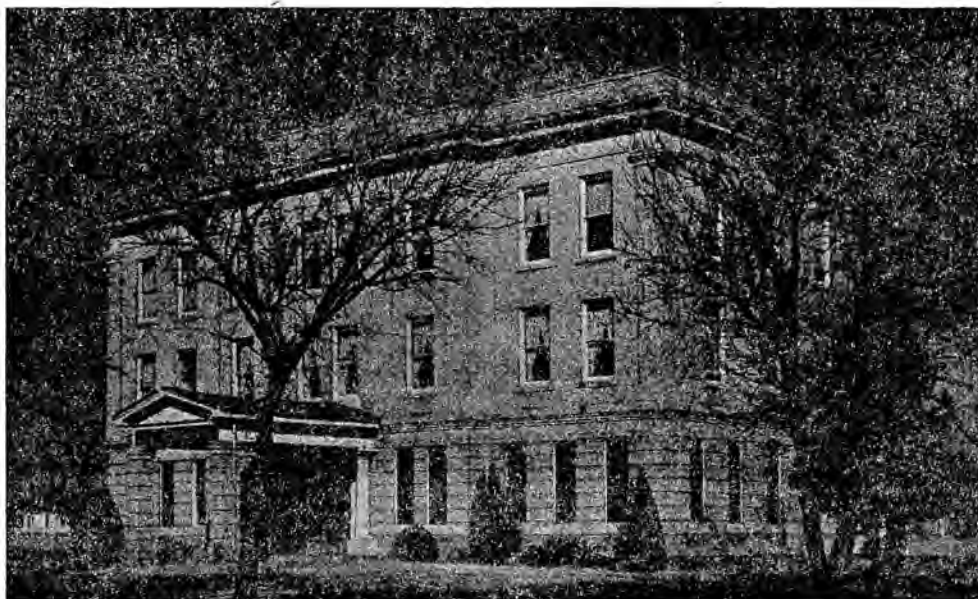
TO BE TORN DOWN — The St. John's Junior School pictured here will be torn down to make room for the new million dollar stadium, a spokesman for the Board of Trustees announced last Friday. Bryan, Robinson, and Walker Demolition Co. has contracted to raze the building. School officials estimate that it will take them only a short while to do the job.