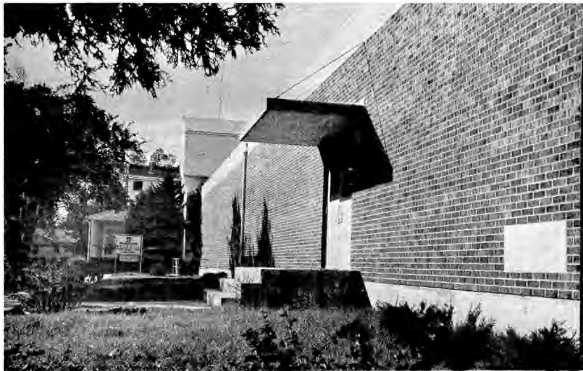
THE SPENCER CADET CENTER will be formally dedicated at 4 p. m., Nov. 22, during the two-day Festival of Thanksgiving at St. John's Military School. Construction was started before the close of the last school year and