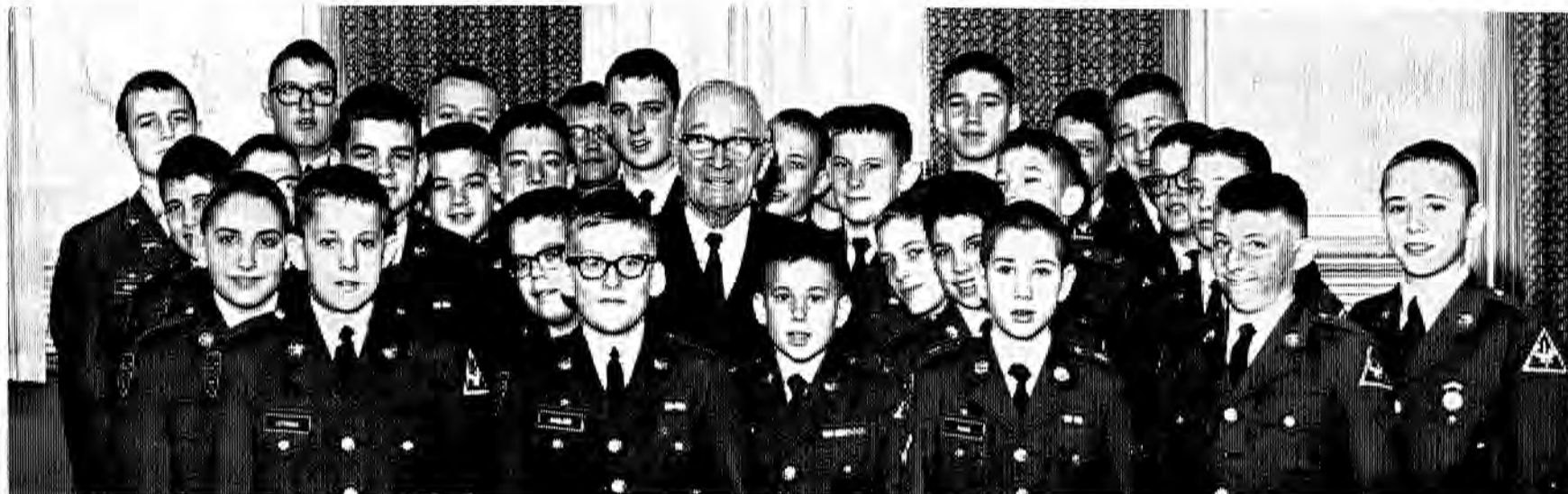
CADETS AND THE FORMER CHIEF — St. John's Military School Lower School Cadets posed with Harry S. Truman, former President of the United States, during a recent visit to the Truman Library in Independence, Missouri.