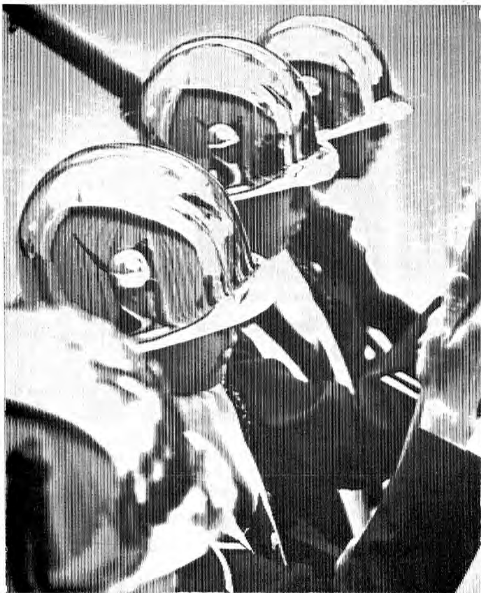
THE COLOR GUARD