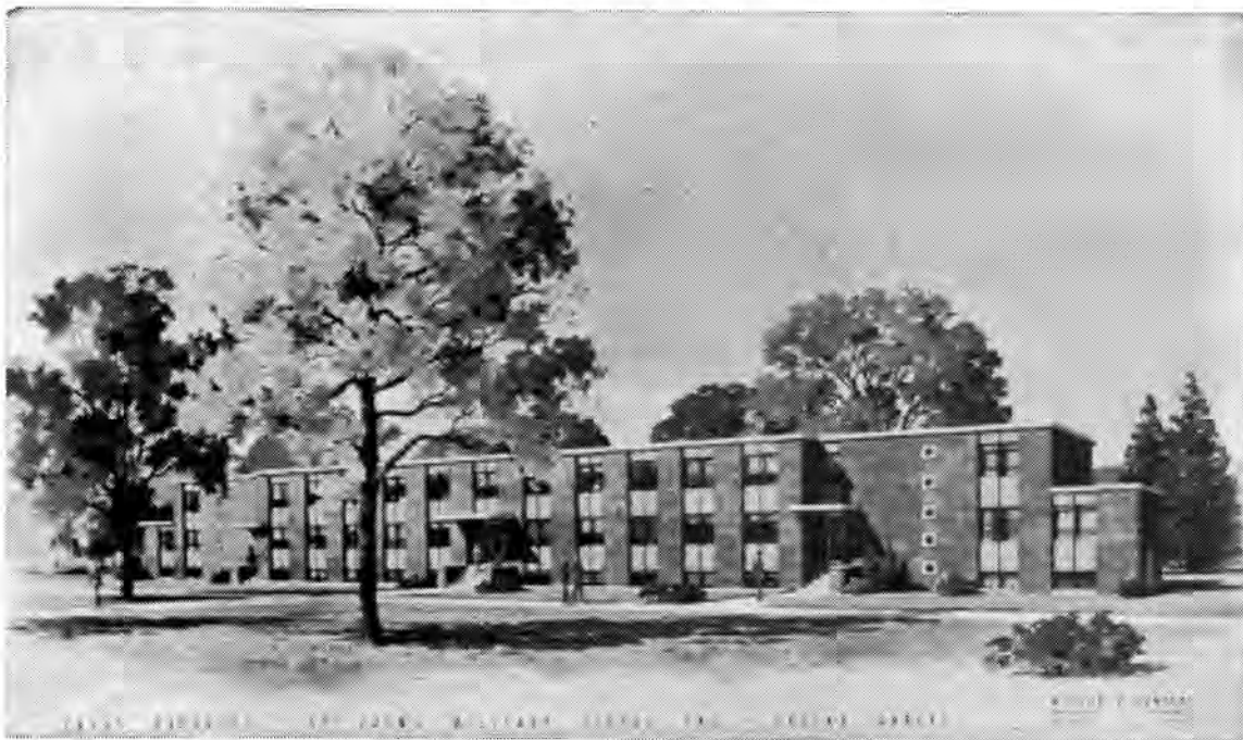
PROPOSED JUNIOR SCHOOL BARRACKS —Pictured above is the architects' concept of how the proposed 88-man dormitory will look when completed. A fund drive to raise $300,000