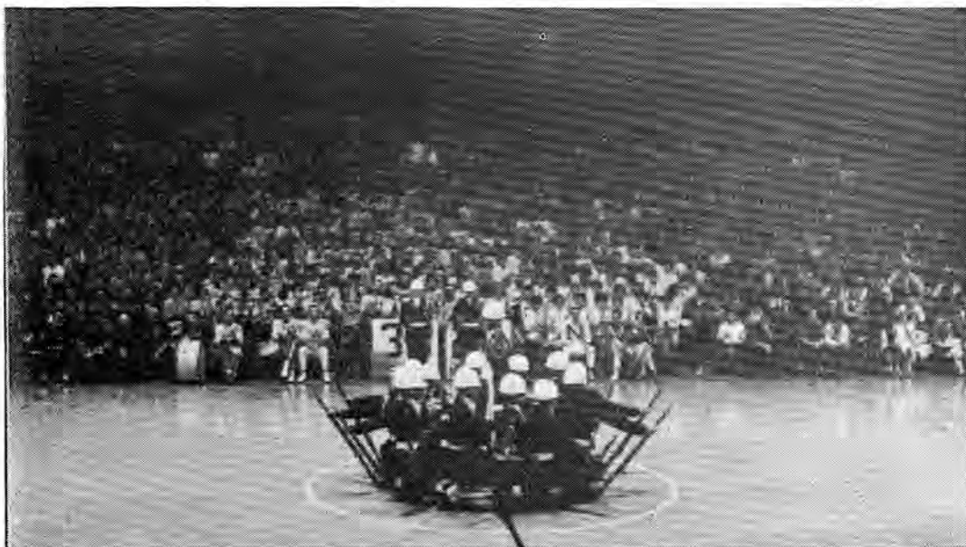
THE ROSE FORMATION is neatly executed by the Crack Drill Squad as part of its drill. The Squad has appeared at Nebraska University, Kansas University and Kansas State University this year.