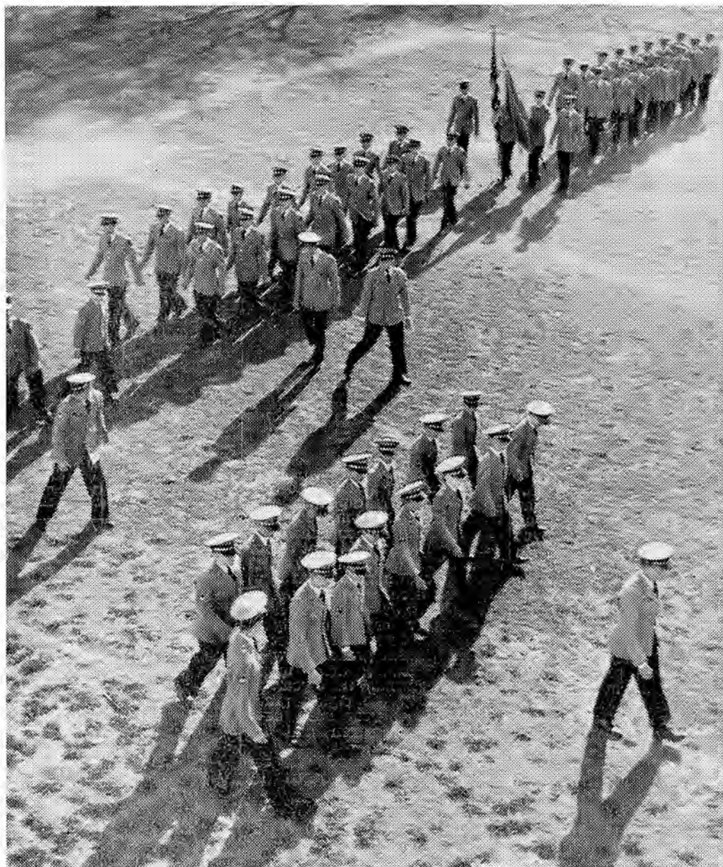
DRESSING DOWN THE PLATOONS at Retreat Parade practice in preparation for Commencement, May 17. The front platoon had completed a flanking movement and was headed toward the reviewing stand when this photo was snapped.

Five issues of the St. John's paper were entered. A Certificate was received from the C.S.P.A. by the staff along with a constructive criticism of the paper.