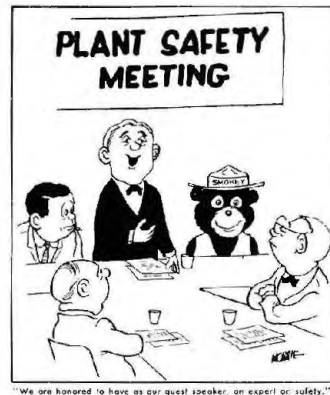
"We are honored to have as our guest speaker, an expert on safety."

The Lower School has also been accepted into the Twin Valley league for basketball and track next year.