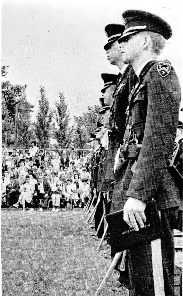
THE LONG SENIOR LINE stands at attention during Commencement proceedings on Perkins Field, May 27.