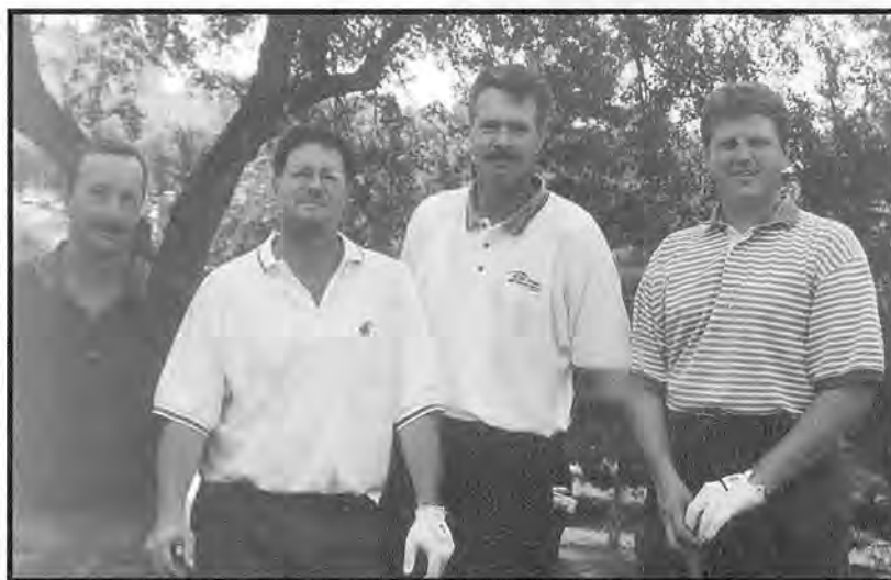
Pictured above, the repeat Champions.