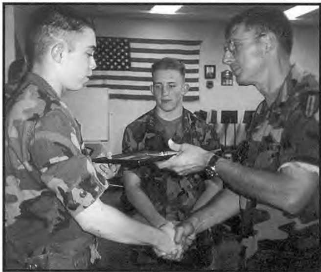
Above, photos of promotions following Leadership Camp.