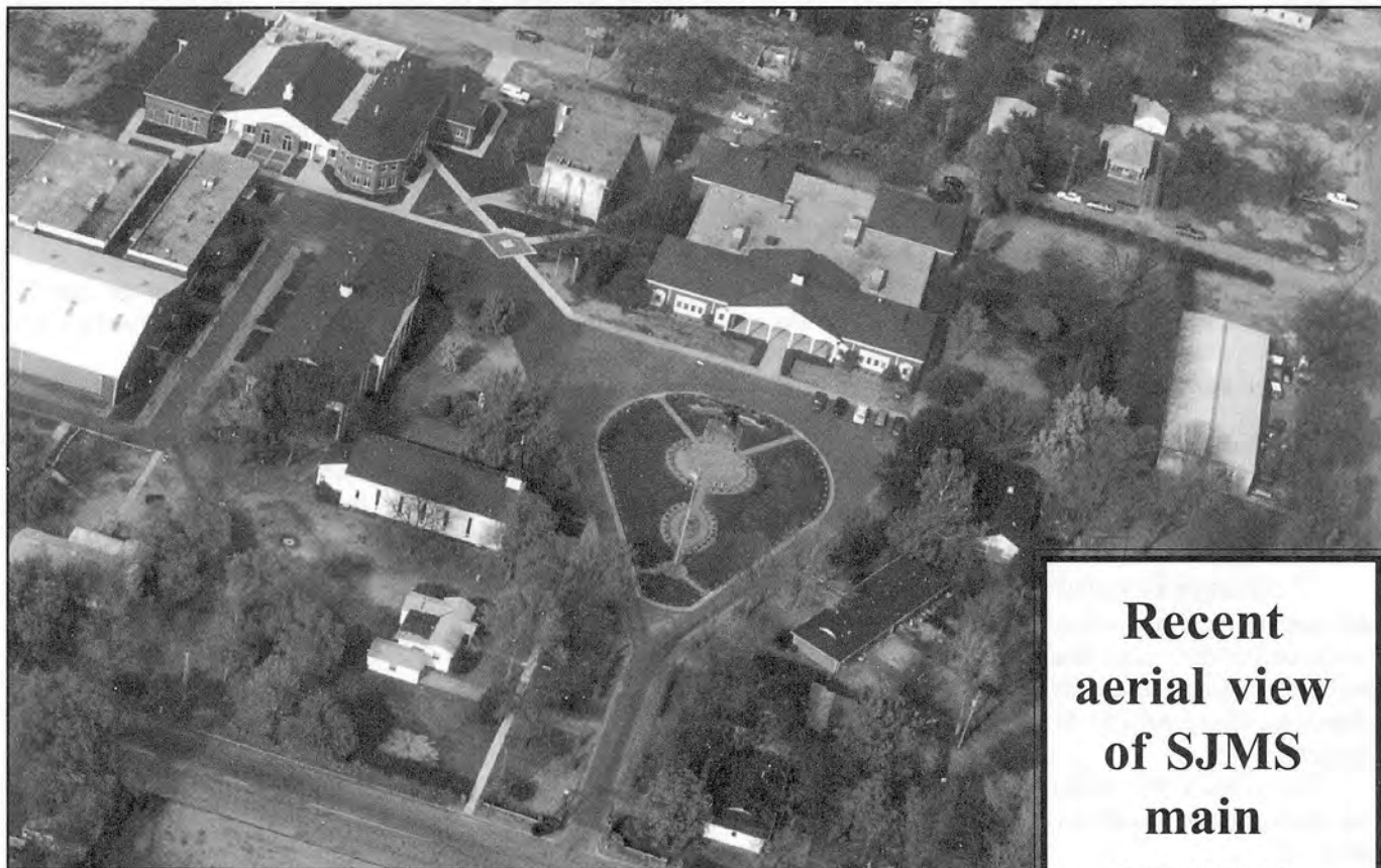
Recent aerial view of SJMS main campus