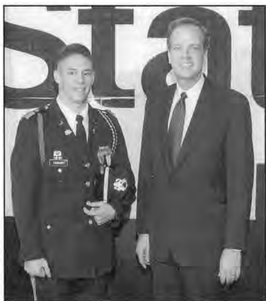
Candidates met personally with Kansas Congressman Jerry Moran during the First District Academy Selection Board meeting held at the Kansas Cosmosphere in Hutchinson.