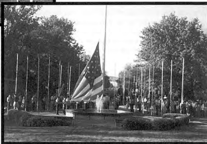
Above, the McPherson Pipe Band performs during Commencement ceremonies. At right, a scene during the flag raising ceremony.

(See related articles throughout Skirmisher.)