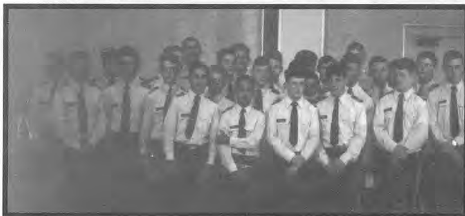
Eight Grade Class Recognized