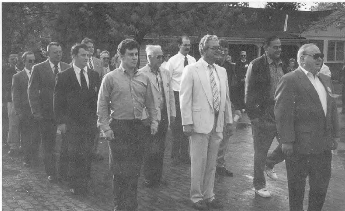
F Troop gets in formation for the Pass in Review following the Flag Raising Ceremony.