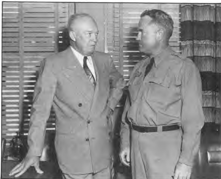
The Colonel meets President-Elect Dwight D. Eisenhower in Denver during the summer of 1952. They talked about Ike's old days as an Abilene school boy.