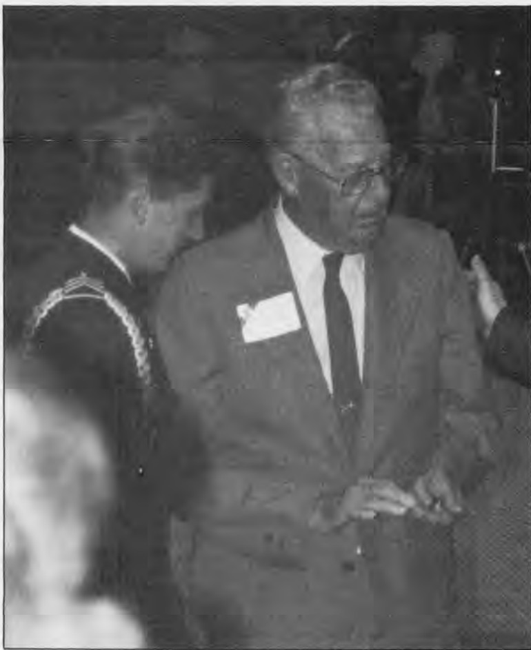
The Ring Ceremony