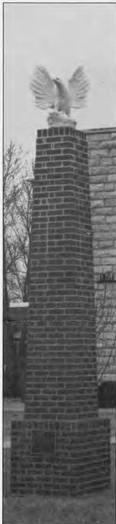
THE EAGLE FLIES atop the Veterans Memorial on the SJMS campus