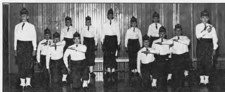
The Junior School Zouaves