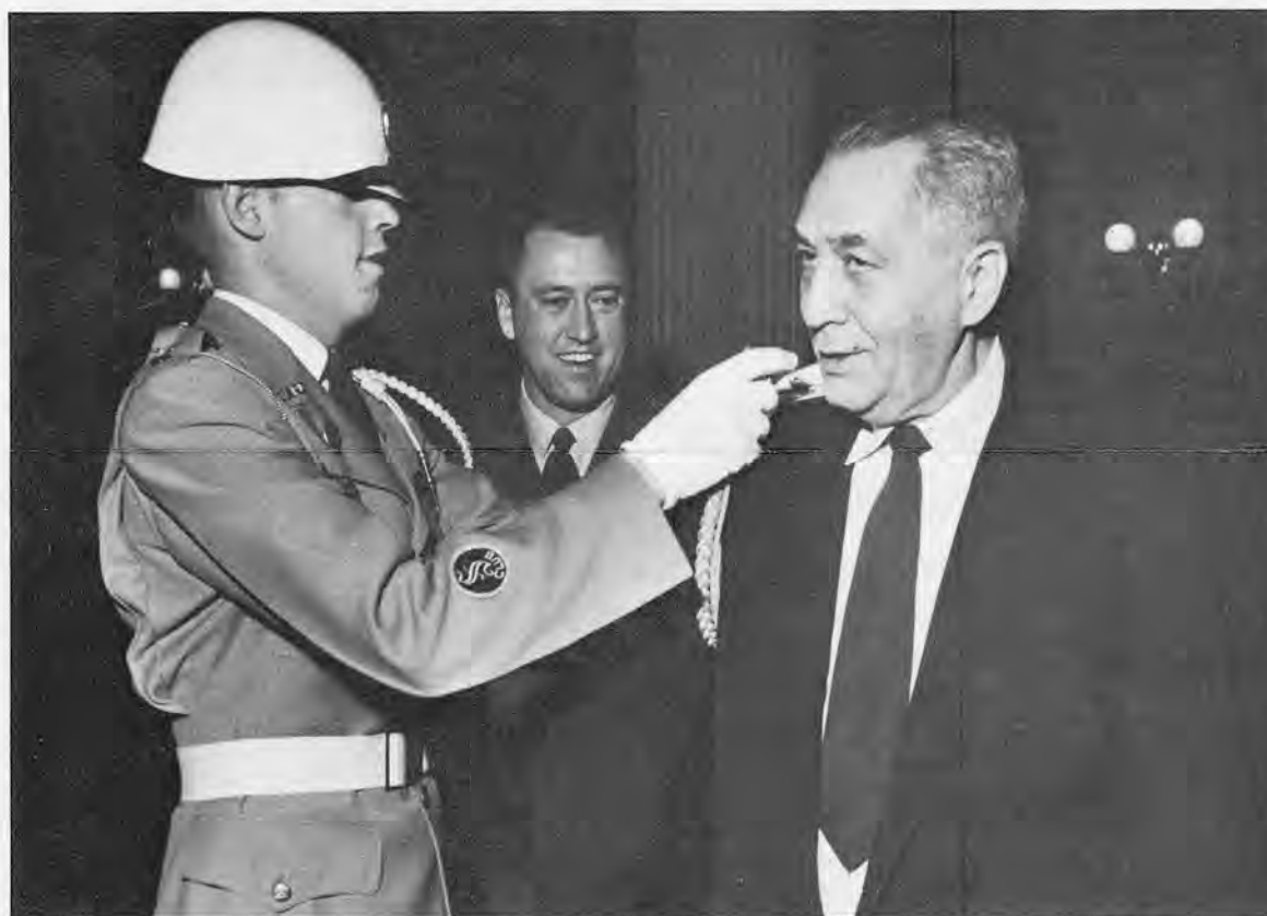
GOVERNOR MADE HONORARY MEMBER