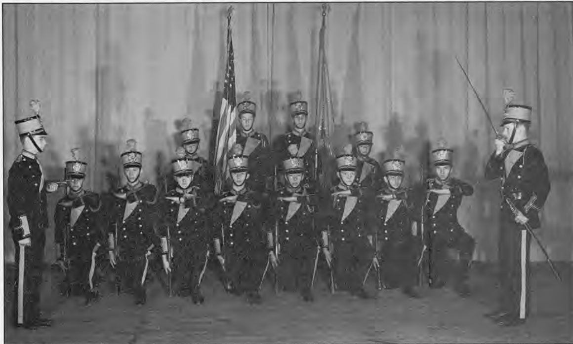
THE CRACK SQUAD as it appeared in the years from 1939-1942.

The Squad has always drilled with the 1903 Springfield rifles, which have been refurbished