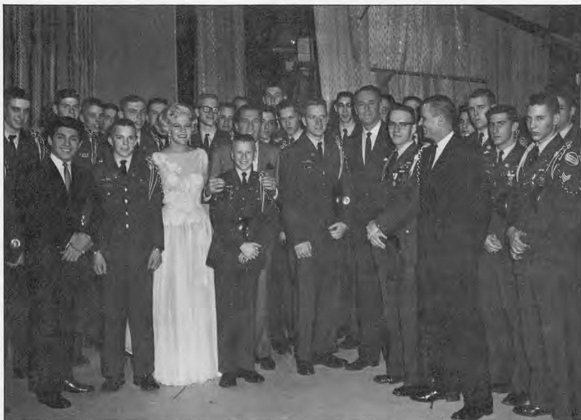
Visiting the Ed Sullivan Show--February 1961