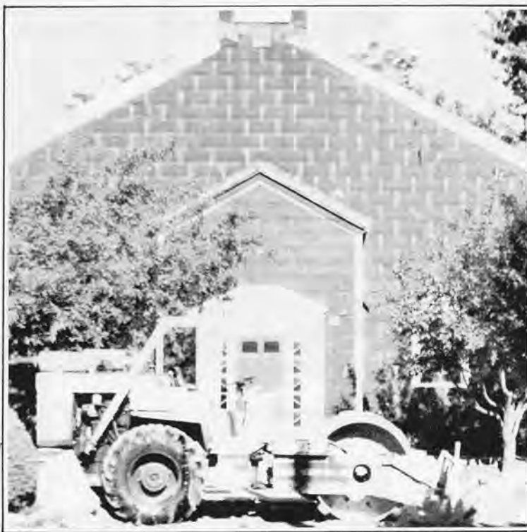
THE RENOVATION PROCESS