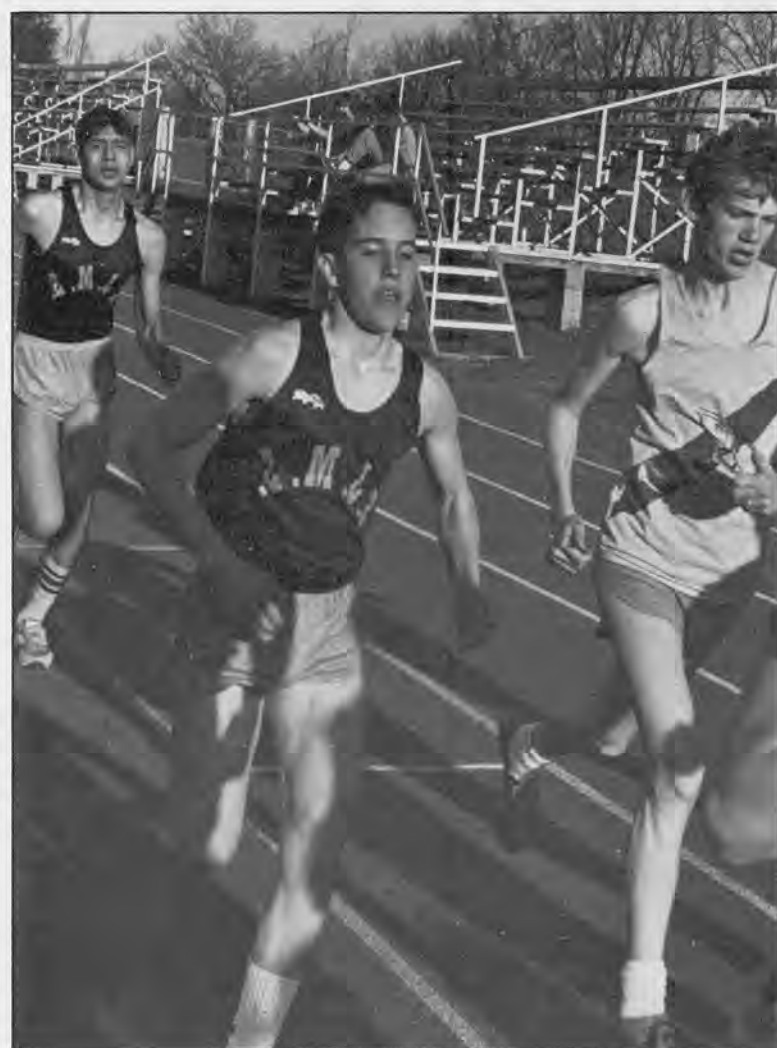
THE MILE RUN