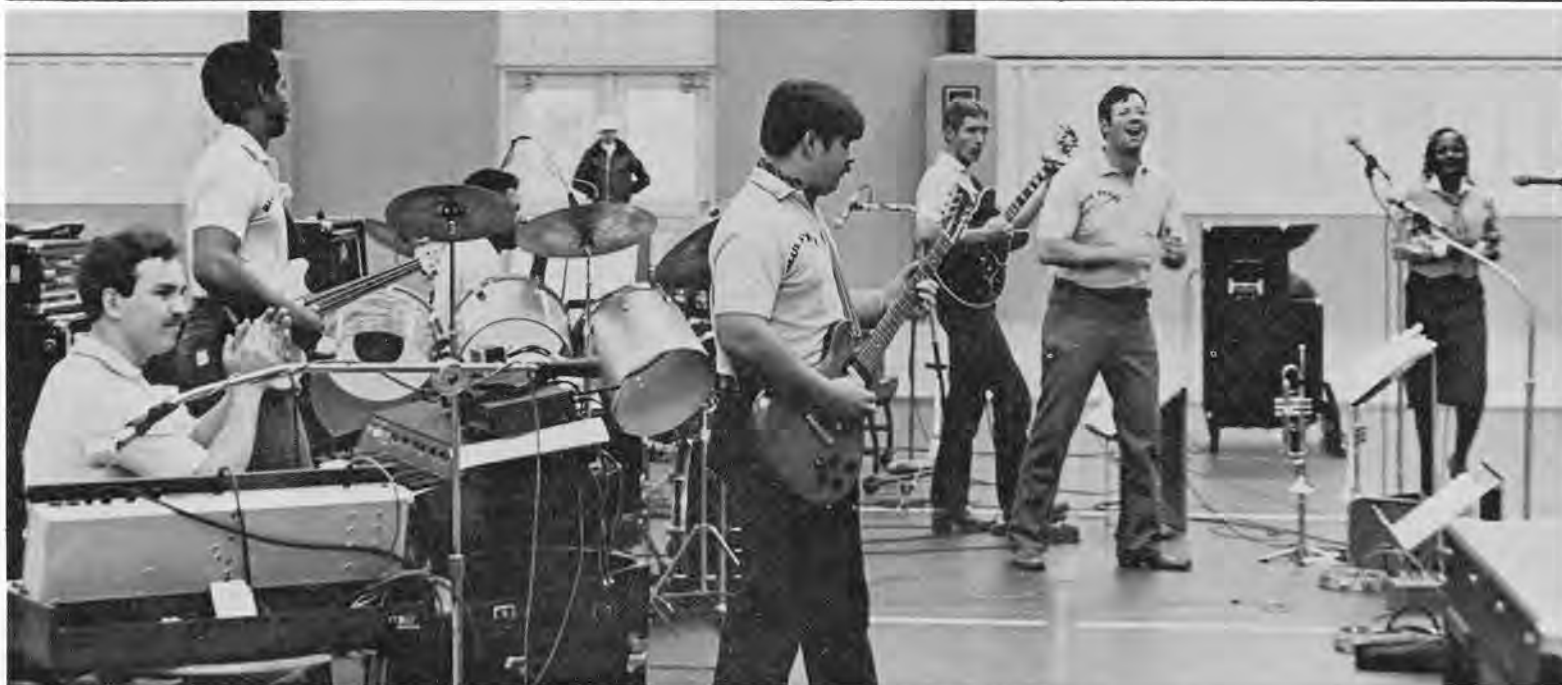
BLUE STEEL -- The U.S. Air Force Academy Rock Band