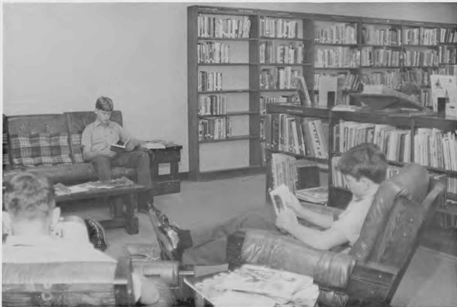
The Turner Memorial Alcove