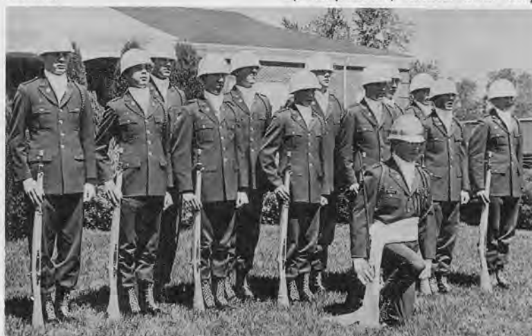
The Prize-Winning Crack Squad