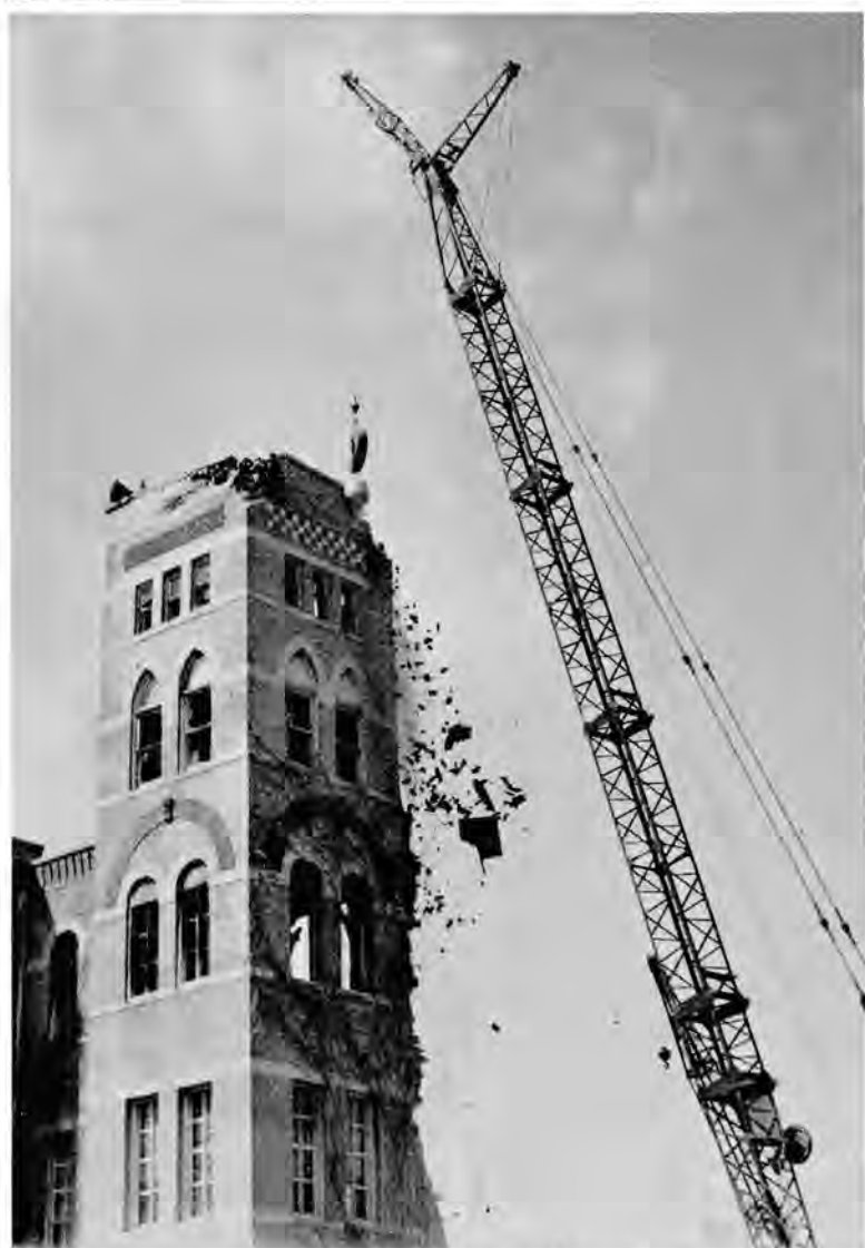
The Tower Comes Down