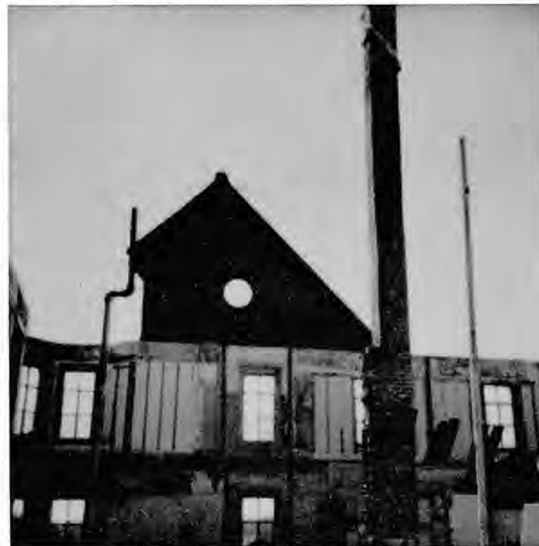
of Griswold Hall