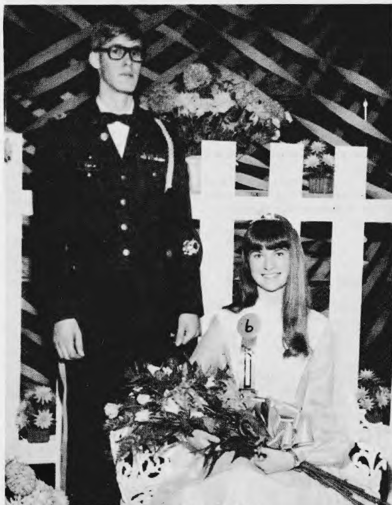
Miss Sound Off

Members of the Corps of Cadets went caroling Dec. 16 and visited the residents of the Crestview nursing home north of Salina.