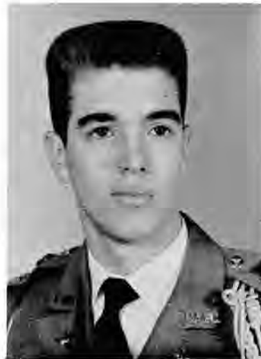
SCHOOL DAYS 54-55