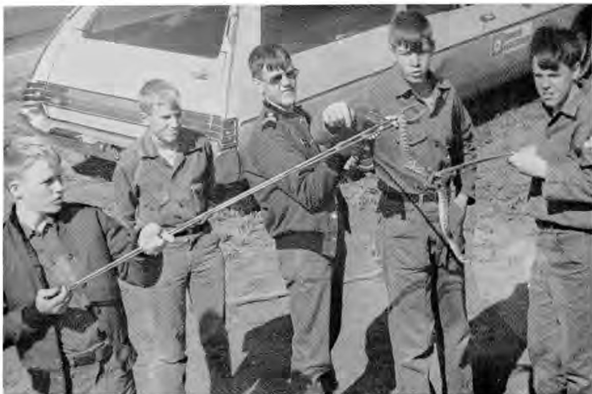
THE RATTLESNAKE —Displaying one of the rattlesnakes they brought back to SJMS from the annual snake hunt near Wynoka,