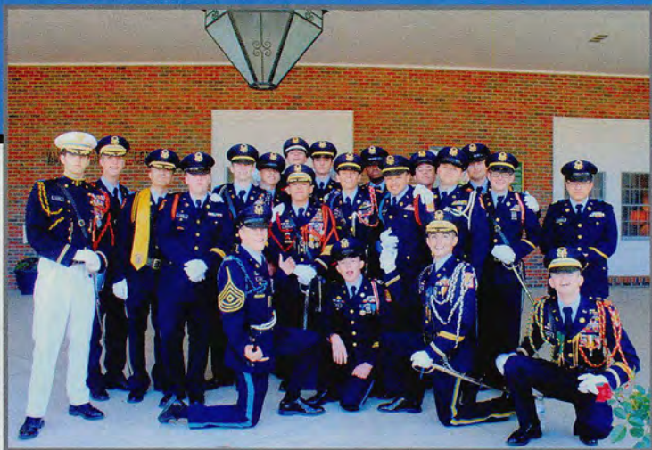
The senior class gathers on the porch of the Vanier Academic Center following the Freedom Tree ceremony.