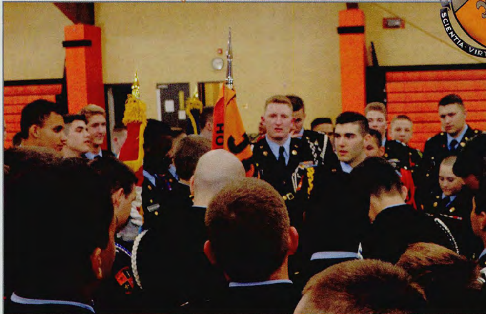
The 129th Corps of Cadets listens to the speech given by the Battalion Commander following the announcement of a perfect score. Gilbert gives the corps credit for their hard work and diligence in earning the highest score possible saying, "It wouldn't have been possible without a total corps effort. Hooah, 129th!"