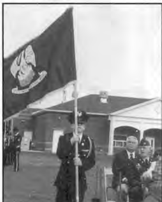
The parade of flags includes flags from each state, country, representing the 113th Corps of Cadets.