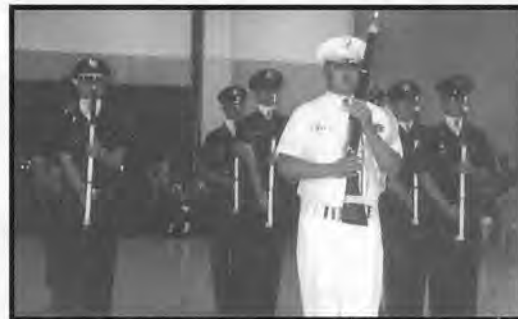
Drill Teams perform during Military Ball.