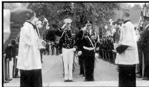
Following staff, the Seniors take part in the Freedom Tree Ceremony.

Salina, Kansas Died April 23, 2001 SJMS Mule-skinner & "Top Gun" Whip-cracker