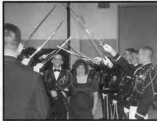
Ring Ceremony, when Juniors receive rings provided by the Foundation.